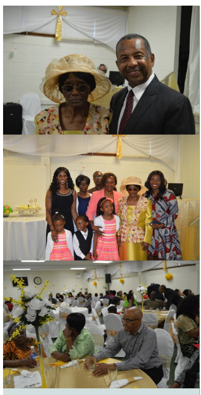
100th Birthday Party

"No one can serve two masters. Either he will hate the one and love the other, or he will be devoted to the one and despise the other. You cannot serve both God and money." Between God and money, which will you choose to love?